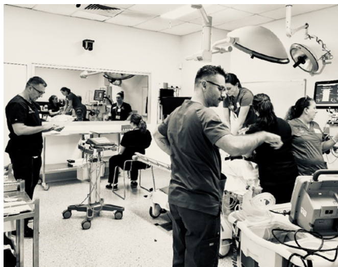
Tactical squad training with Royal Brisbane Womens Hospital