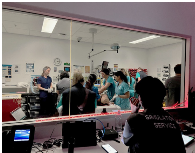
Emergency Department Simulation at Gold Coast Health