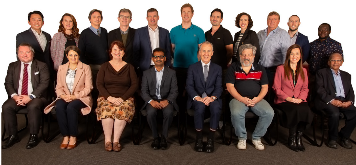
Centre for Data Analytics Team